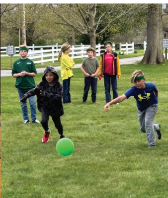
DEIB Kickball Night