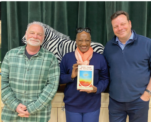
Care for Rare