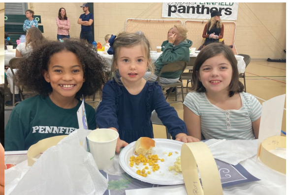
All School Feast