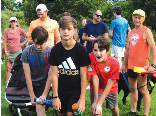
Family Fun Run