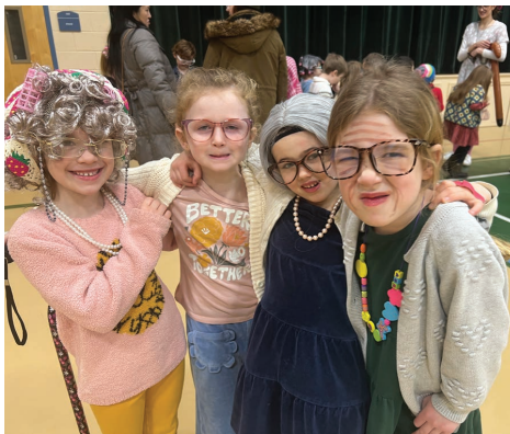
100th Day of School