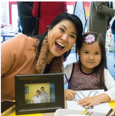
Grandparents & Special Friends Day